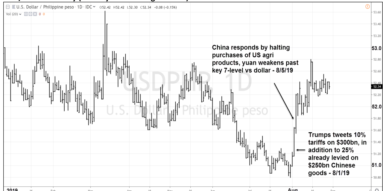
USD/PHP Rate Daily (January 2019 to August 2019)

The day after Trump’s August 1 announcement escalating the trade war, the Philippine peso fell 0.9%, followed by another 1.1% drop on August 5, as shown in the chart below. The PSE index also suffered a 3% decline on August 5 and another 1.6% drop the next day.